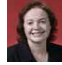
SENATOR CAROL BROWN Australian Labor Party Hobart Pathology, Hobart September 2014