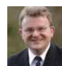
HON BRUCE BILLSON MP Liberal Party of Australia Dorevitch Pathology, Frankston Hospital, August 2015