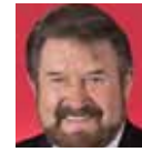
SEN. DERRYN HINCH Justice Party 6 April Melbourne Pathology