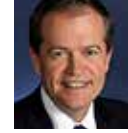
HON BILL SHORTEN MP Australian Labor Party Western Diagnostics, Darwin January 2016