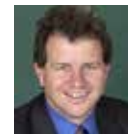
DR DENNIS JENSEN MP Liberal Party of Australia Western Diagnostics Pathology, Perth, September 2014