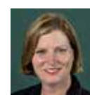
JULIE OWENS MP Australian Labor Party NSW Health Pathology, Westmead Hospital, September 2016