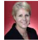
SENATOR CATRYNA BILYK Australian Labor Party Hobart Pathology, Hobart September 2014