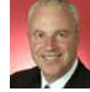
SENATOR GAVIN MARSHALL Australian Labor Party Melbourne Pathology, Melbourne March 2016