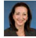
MS GAI BRODTMANN MP Australian Labor Party ACT Pathology, Canberra Hospital, December 2014