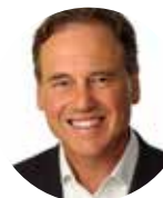
Greg Hunt MP Liberal Party of Australia