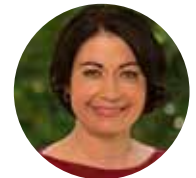
Terri Butler MP Australian Labor Party