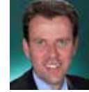
MR DAN TEHAN MP Liberal Party of Australia Dorevitch Pathology, Hamilton Base Hospital, August 2014